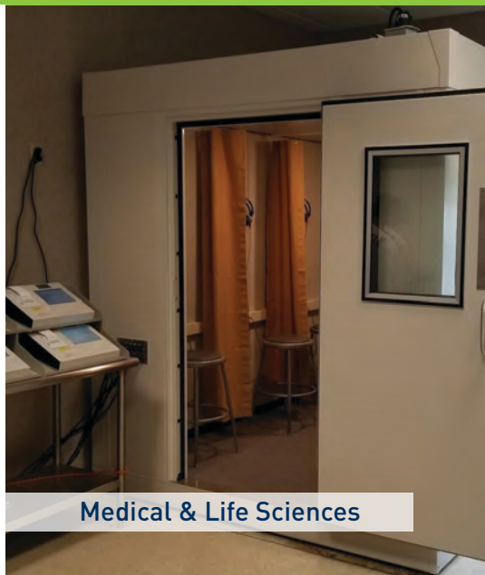
Medical & Life Sciences